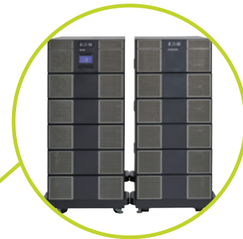
Smart EBM technology identifies batteries automatically