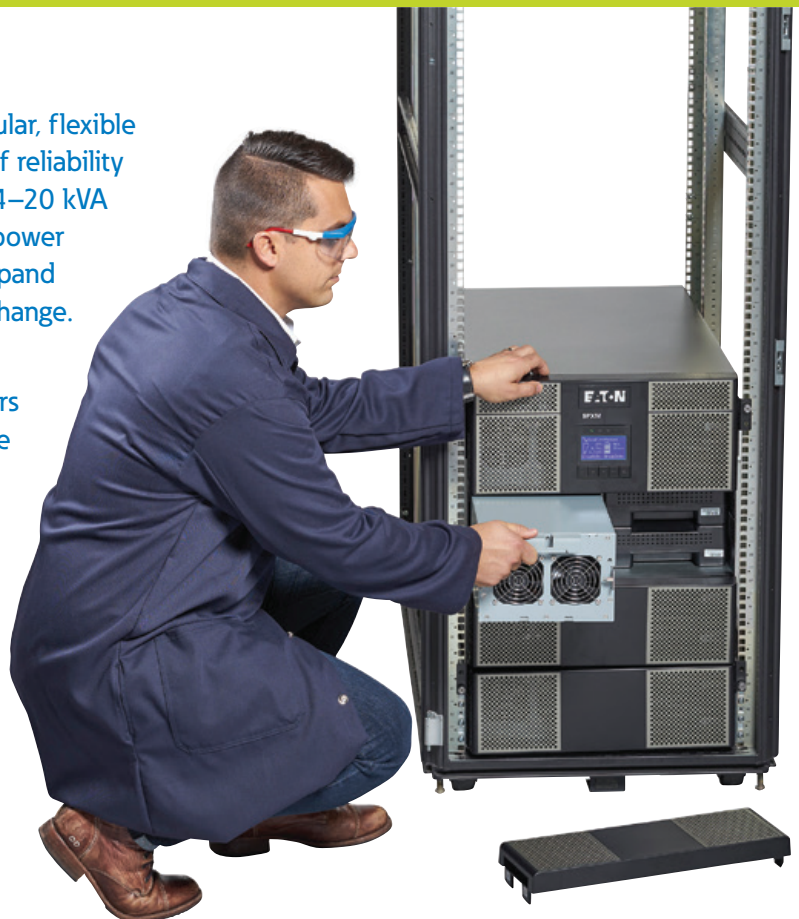
Easy hot-swappable power and battery modules

The plug-and-play power and battery modules are user replaceable so customers can add them as needed without a service call or having to put a redundant system in bypass. With its low initial investment, online double-conversion technology, Eaton ABM® technology and high efficiency mode, you never have to compromise reliability for efficiency.