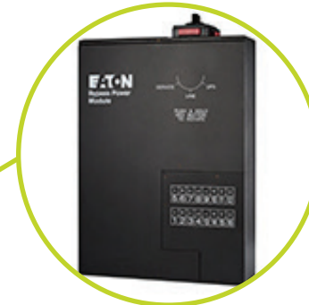
External bypass power module