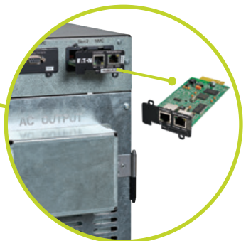
2 mini-slot ports for options using Network-MS gives access to Eaton's software offerings