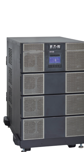
8-slot cabinet is scalable to 16 kVA in a 14U cabinet