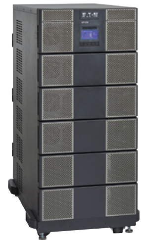
12-slot cabinet is scalable to 20 kVA (N + 1) in a 21U cabinet