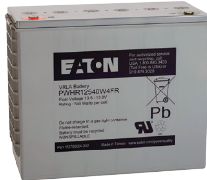
Eaton 12V 540-watt battery