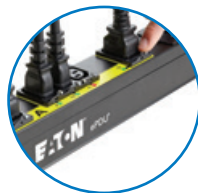
Secure plugs in place with a lever-actuated grip to prevent accidental disconnect.