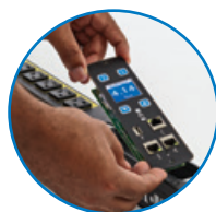
Increase uptime while enhancing serviceability with ability to remove network management module without removing power to the ePDU.