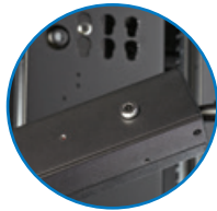
Pre-installed mounting buttons reduce installation time.