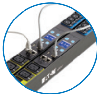
Daisy chain up to eight ePDUs to share same network connection and IP address.